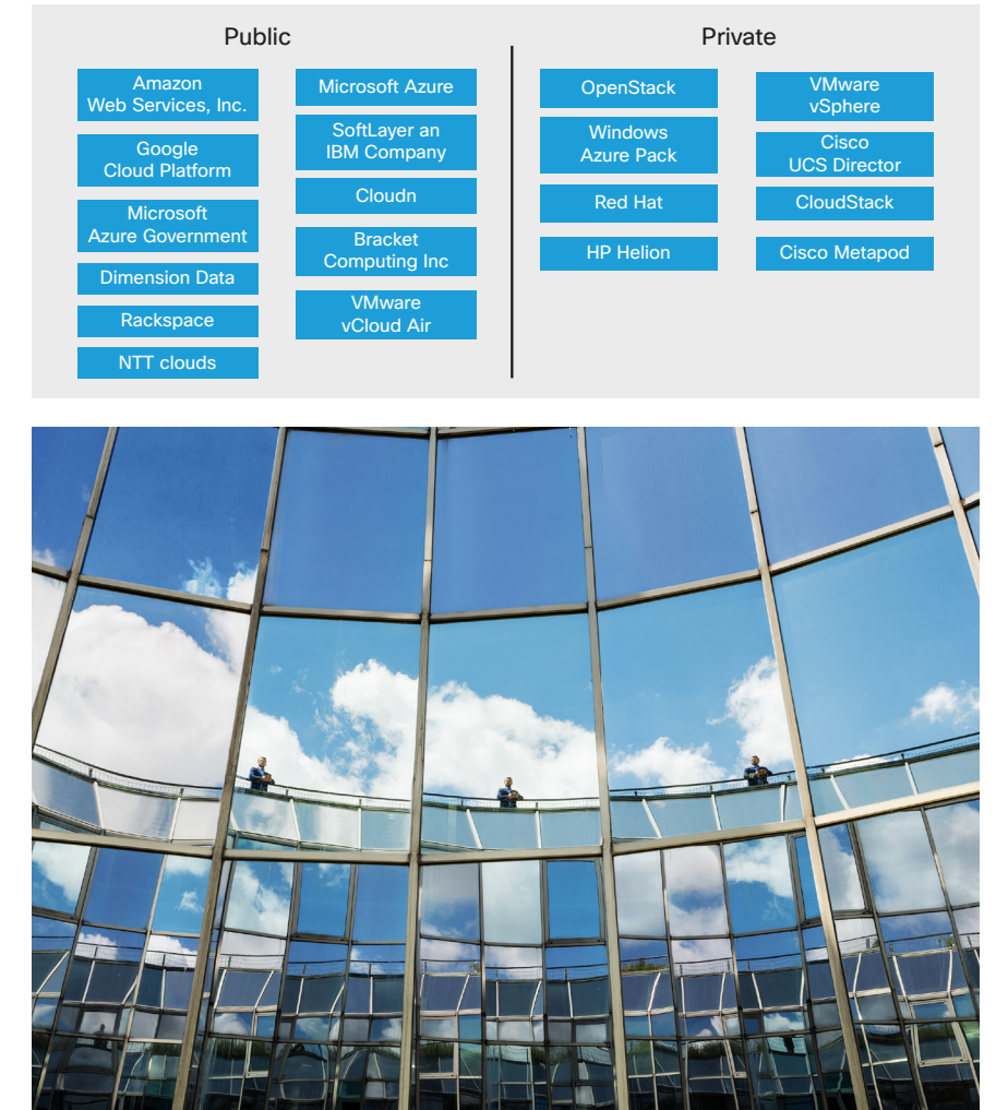
Figure 3. Cisco CloudCenter Solution Supports More Than 19 Environments